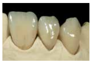
Final Restauration offering colour & gloss

With the Lustre Pastes NF you can easily modify your conventional ceramic crown and bridgework. Changing the brightness, colour and value has never been so easy!