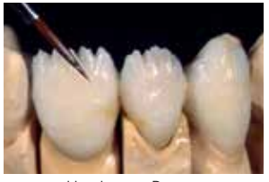
Use Lustre Pastes