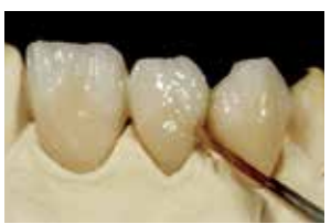
Application of Body Shades